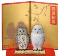
2017: Rooster (Owl)