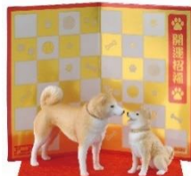
2018: Dog (Shiba Inu)