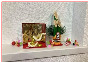
Images showing usage scenarios