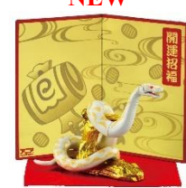
2025: Snake (Snake)