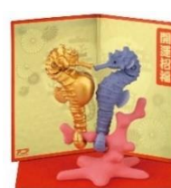
2024: Dragon (Seahorse)