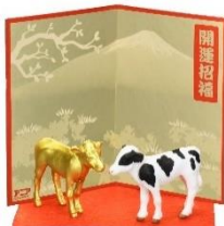
2021: Ox (Ox)