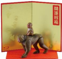
2016: Monkey (Japanese Macaque)