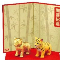
2022: Tiger (Tiger)