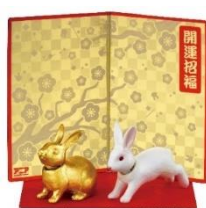
2023: Rabbit (Rabbit)