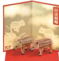
2019: Boar (Boar) / (Pig for Asia only)