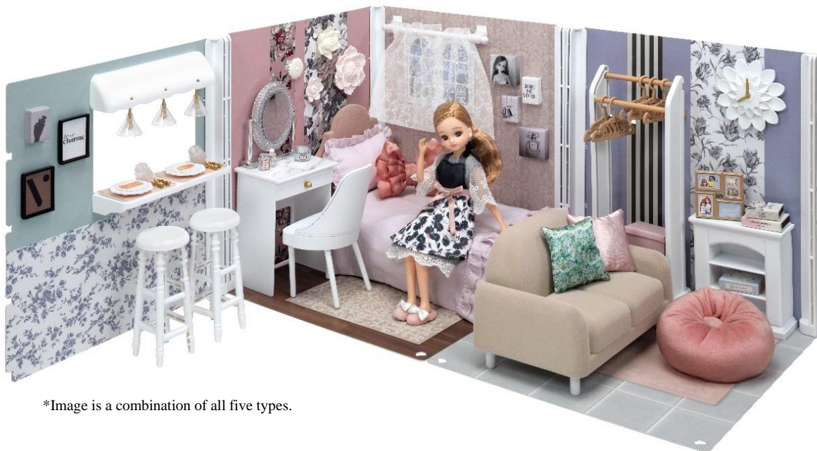
*Image is a combination of all five types.