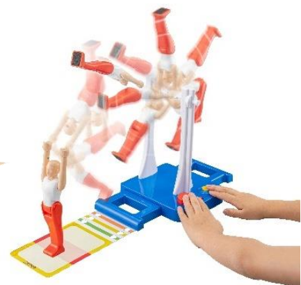
Product left: “Sports Human Soccer” Bottom left: “Sports Human Basketball” Bottom right: “Sports Human Horizontal Bar”

The “Sports Human” series are acrobatic sports action toys that can be played with human-like figures, allowing users to recreate spectacular super plays in soccer, basketball, and horizontal bars. The appeal of this series is the simple operability that makes you want to try again and again until you get the hang of it, the exhilaration when the super play you envisioned is achieved, and the acrobatic movements that look great in videos posted on social media and other video sharing sites.