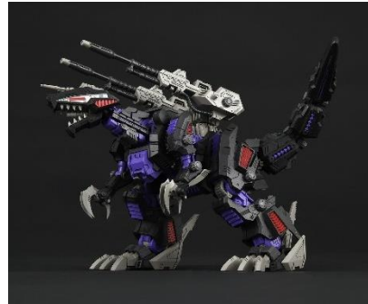
Right) "RMZ-02 GENO SAURER"