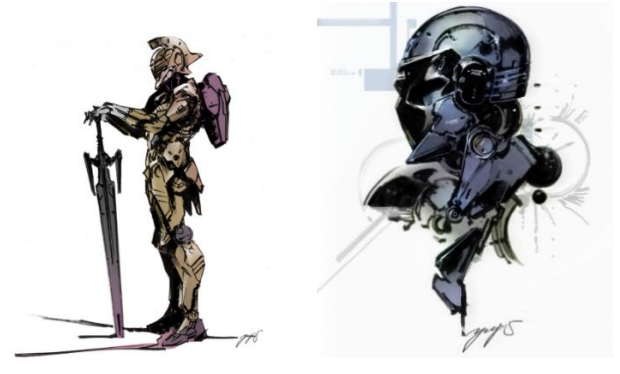
Illustration for "PROJECT: M" (tentative name)