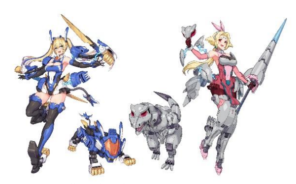
Illustration of METAMOR VERSE