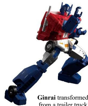
Ginrai transformed from a trailer truck

(*2) Ginrai was ranked No. 1 in a survey of product purchasers as a character they would like to see made into an MP. (Takara Tomy Mall product purchaser survey, implemented to 190 people in 2021)