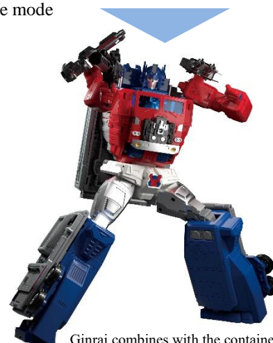
Ginrai combines with the container to become Super Ginrai!