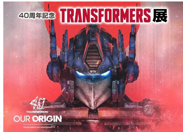
Key visual for the 40th Anniversary TRANSFORMERS