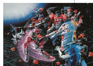
TV animation "Transformers: Super-God Masterforce" will also be broadcast!