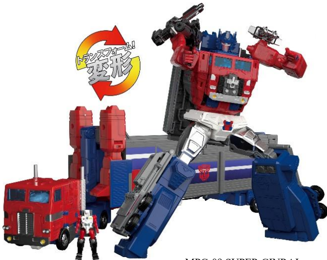
MPG-09 SUPER GINRAI

The God Ginrai project will be launched today, Wednesday, April 10, as part of the 40th anniversary commemorative event. In addition, various other events will be held, such as the 40th Anniversary TRANSFORMERS Exhibition and corporate collaborations to make the commemorative year even more exciting.